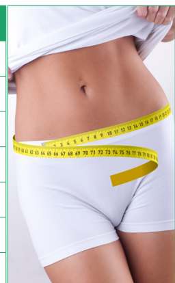
Measurement at the widest abdominal circumference